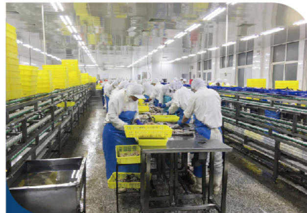
人工：6条/分钟 Manual: 6条/min