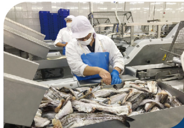
机器：24-36条/分钟 Machine: 24-36条/min

Start suitable quantities of filleting machines flexibly according to production plan.